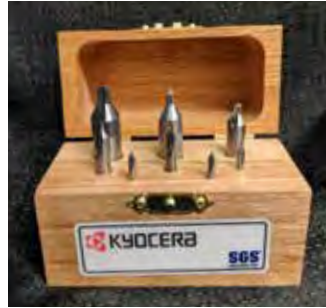
Pictured: Series 301 Set